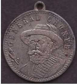
LOT 435 OBVERSE