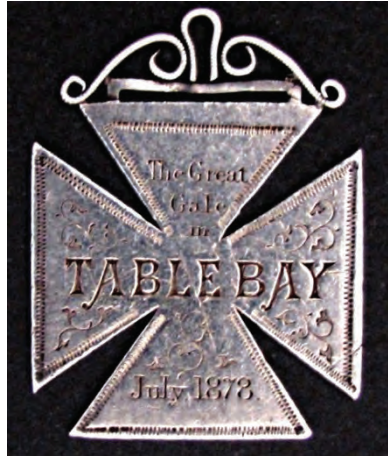
LOT 2 REVERSE