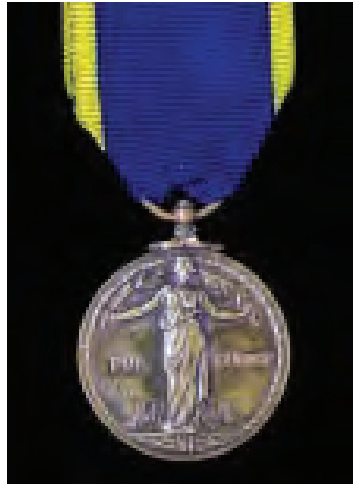
LOT 12 REVERSE