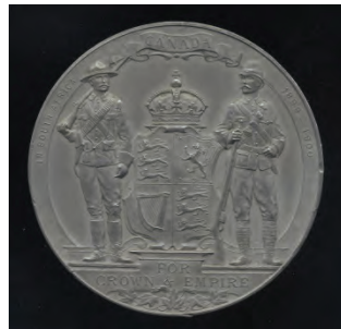
LOT 437 REVERSE