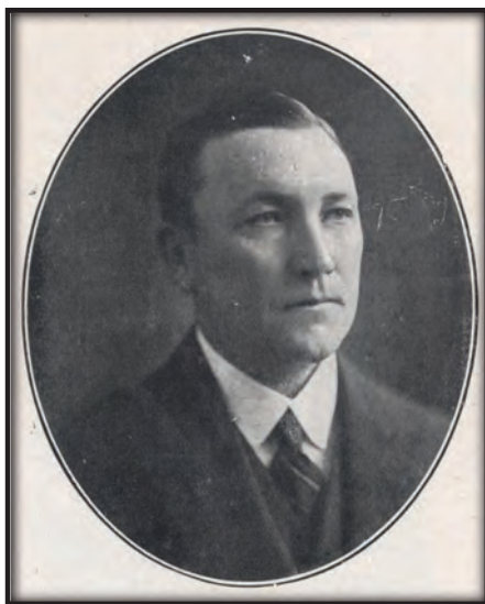
NICOLAAS CHRISTIAAN HAVENGA

Nicolaas Christiaan Havenga was born on 1 May 1882. He took part in the battles of Belmont, Graspan and Modder River as a 17 year old member of the Fauresmith Commando. His part in a futile attempt to disrupt the railway line at Graspan on the 7th December prevented him from fighting at the battle of Magersfontein. However, he fought at Poplar Grove and Abrahamskraal and watched Lord Roberts enter Bloemfontein unhindered on 13 March 1900. After the British proclamation on 15 March he joined the remnants of the Jacobsdal and Fauresmith Commandos. In July 1900 he escaped from the Brandwater Basin near Fouriesburg and on 10 August 1900 he joined General J B M Hertzog at Heilbron and became his secretary. This was the beginning of a lifelong friendship. He served General Hertzog capably throughout the war, in the course of which he was wounded three times. On the last occasion, during an attempt to penetrate a blockhouse line near Bethlehem (March 1902), he was seriously wounded in the right thigh, captured by the British and taken to the hospital in Kroonstad.