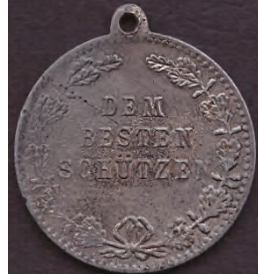
LOT 435 REVERSE