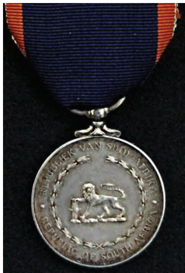
LOT 6 REVERSE