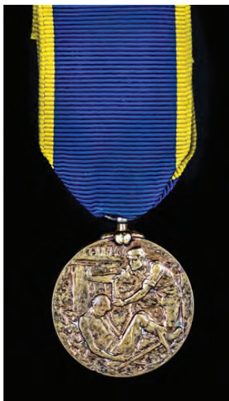
LOT 11 REVERSE