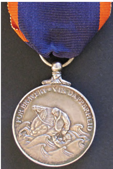
LOT 5 OBVERSE