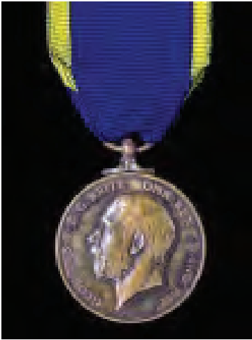
LOT 12 OBVERSE