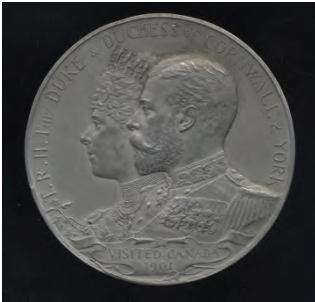
LOT 437 OBVERSE